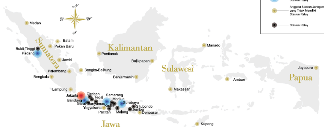
Indosiar network of TV relay stations