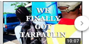
DOMINICA FINALLY GETS TARPAULINS for ROOFS ✓ MystProductionz 4.5K views • 5 days ago

Besides the government and local media, some individuals have stepped up their game and started reporting on the recovery, from their perspective. As much as it gives a very rich, alternative perspective on what's going on.