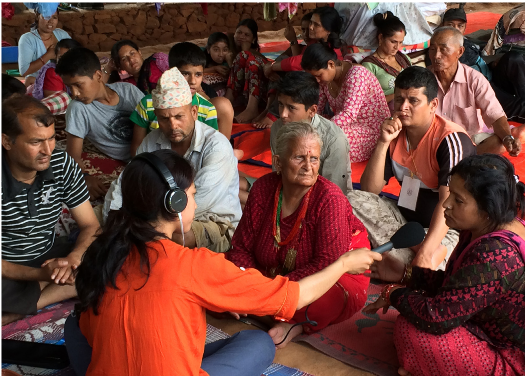
BBC MEDIA ACTION